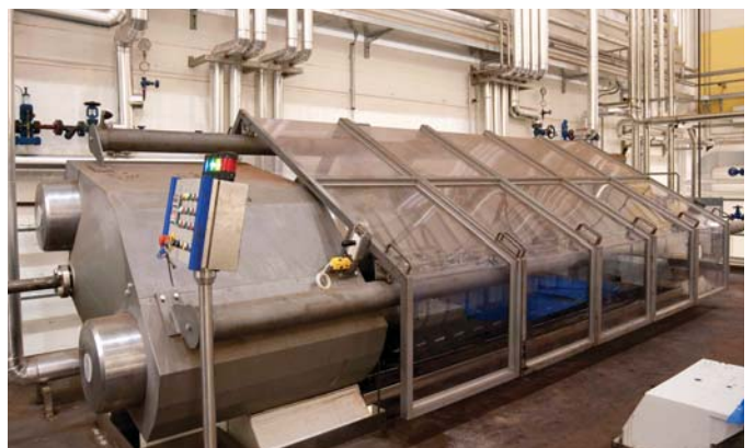
The first two of eight conches will supply finished chocolate to four moulding lines for a variety of products. The first of three cocoa presses will handle cocoa powder and cocoa butter production needs.