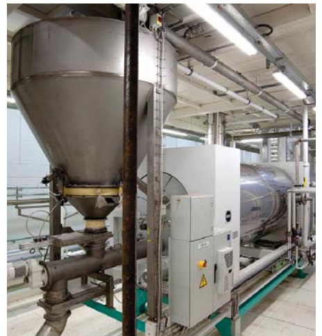
(From l. to r.) The new facility in Orsenigo features the largest cocoa bean processing complex, which includes a three-story roasting, mixing and grinding complex.